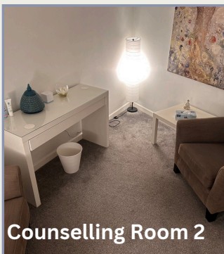
Counselling Room 2