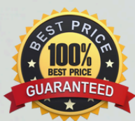
Best Price Policy