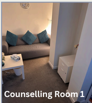
Counselling Room 1